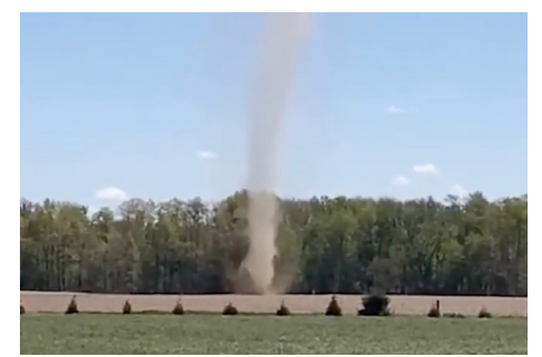
Dust Devil in Vicksburg, MI.

Agriculture was impacted this spring from early warmth in March that spurred early development. This was followed by several late-season freezes and snow events in April and May. Cooler weather later in the season also led to pollination issues as bees were less active during these stretches of colder weather. This spring, however, corn and soybean planting are ahead of average for this time of year but drought continues to remains a concern for the summer.